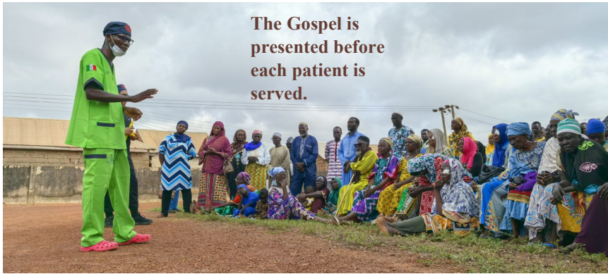
The Gospel is presented before each patient is served.