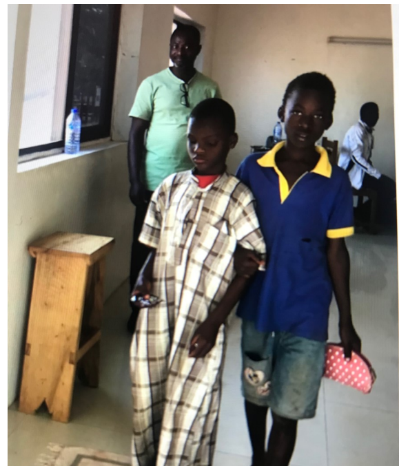
This young boy brought his blind younger sibling seeking help.