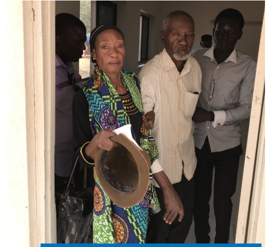
A wife seeking help for her blind husband. His surgery was successful.