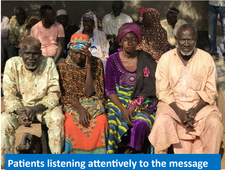
Patients listening attentively to the message of salvation.